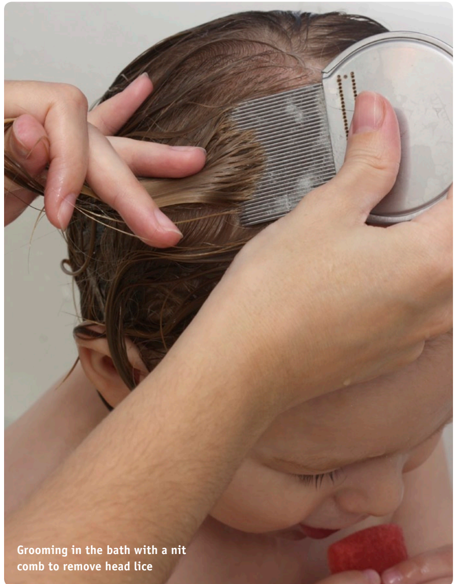
Grooming in the bath with a nit comb to remove head lice

"Getting lice does not mean you are dirty—it only means that you've been around others with head lice,"